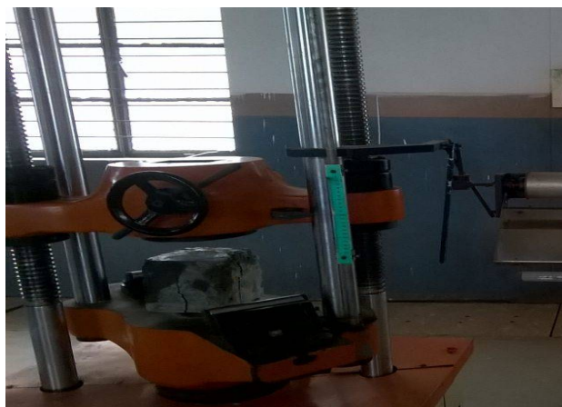
Figure 2.2 Compression Test