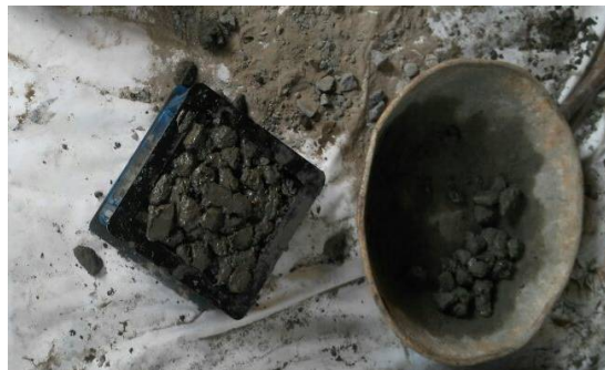
Figure 2.1 Casting of specimen